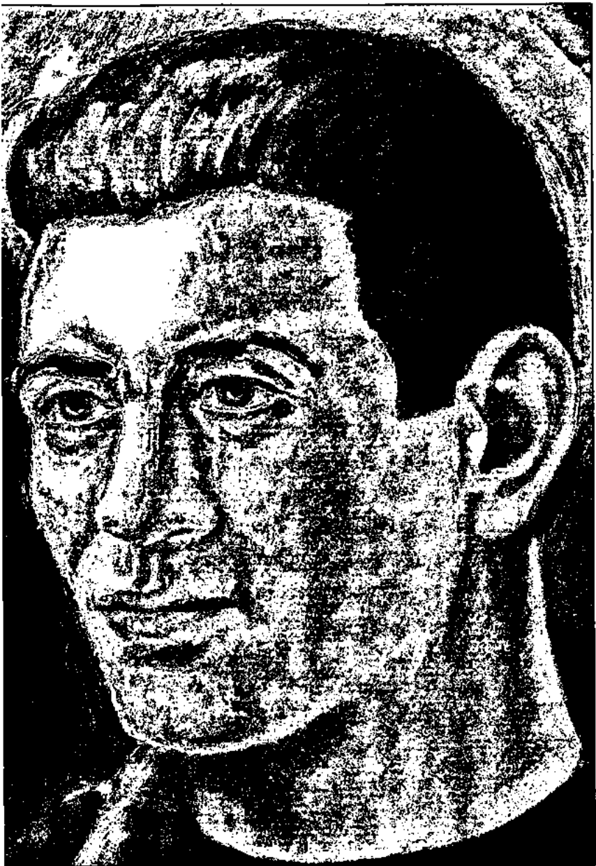
Robert F. Butts (1919–): Imaginary Character . 1968. Oil on panel, 10 x 9 \frac{3}{8} in.

The individual I painted in 1968 is very similar to the magical "Captain Marvel" kind of character I created 12 years later, in my dream in 1980. I do not claim any connections between the two, although some may exist on other than conscious levels.